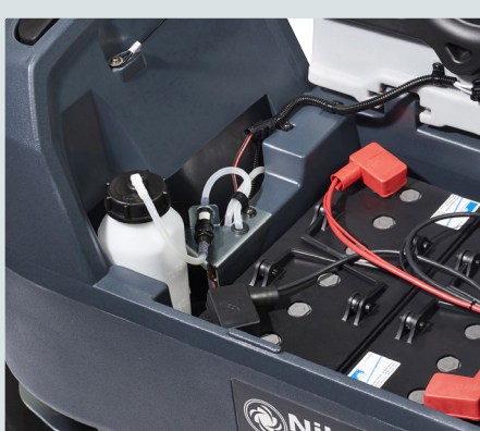
Detergent mixing system gives the user the option to clean with water only and to add detergent when really needed