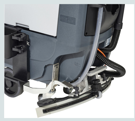
Increased suction performance with the curved squeegee system and patented blade retainer