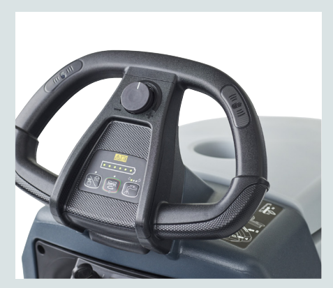
Ergonomic handle with touchpoints, One-Touch™ button and instruction stickers makes the machine simple for the operator to get started