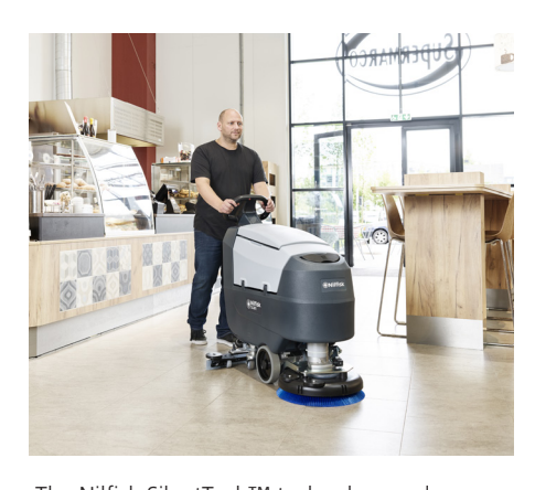
The Nilfisk SilentTech<sup>™</sup> technology reduces the sound level from 65dB(A) - and down to 60dB(A) in silent mode